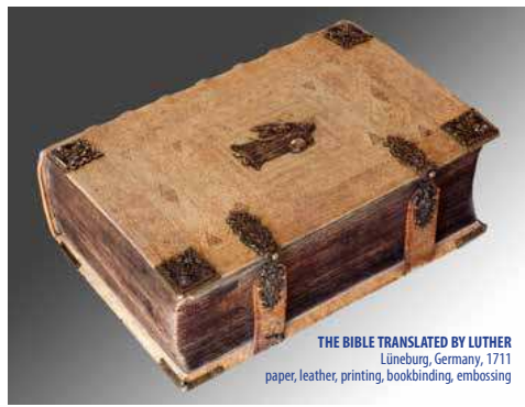
THE BIBLE TRANSLATED BY LUTHER Lüneburg, Germany, 1711 paper, leather, printing, bookbinding, embossing

The further part of the exhibition leads us to modern times, just after the Thirty Years' War (1618 – 1648) which destroyed the town entirely. The town was granted the privilege of dealing in flaxen voile in 1630 which ensured the economic boom and development of other crafts. The significance of the Merchants Association and developed flaxen voile trade for the town was emphasised by building in 1914 a special miniature at the museum. It was a miniature of a main square house with an interior depicting wealth and