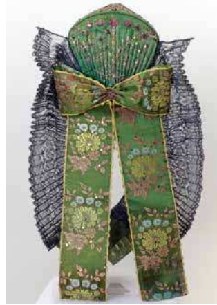
TWO-PIECE BONNET 2 nd half of the 19 th century

Another exposition shows old and modern folk art of the region. We can experience the rural culture, which disappeared during historic changes after 1945, visiting a peasant cottage built on to the museum in 1914. The cottage, constructed as Upper Lusatian house, and models of houses in front of it show the beauty of the region's architecture. Inside the cottage we can observe a typical interior arrangement and furnishings in a living space: rich polychrome furniture and household appliances. Outside the cottage we enter the world of folk art and craft. In the room to the left we learn about the oldest and longest practiced crafts such as carpentry, cooperage, wheelwrighting and smithery. We can also watch the film about stages