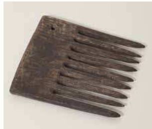
WEAVING COMB Middle Ages Jelenia Góra, Krótka Street, research of well backfill wood

The Karkonosze Museum offers a journey to old Jelenia Góra. Our permanent exhibition is dedicated to history, culture and art of the town of Jelenia Góra and the region. The archaeological part includes historical treasures from the distant times such as Stone or Bronze Age and shows how the town was forming and shaping into modern organism. The prehistory is illustrated by Palaeolithic, Neolithic, Bronze and early