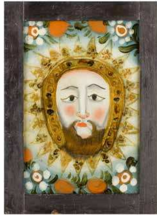
MANDYLION (IMAGE OF EDESSA) end of the 18 th century

of flax processing and compare it with the exhibited weaving tools, fabrics, clothes and caps presented on mannequins. On the right-hand side of the room we find the colourful world of folk art inseparably connected with the sacred – glass paintings and sculptures. Pyramid crib and gingerbread pans are related to observances. Herbalists and folk chemists were necessary in nineteenth century villages in Karkonosze, therefore some of the exhibits are glass vials, little bottles, huge cans and storage vessels, painted and tagged bark boxes used for keeping mixtures, ointments and herbal sets either for sale or as packaging for medica-