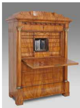
SECRETARY Silesia, around 1820 wood, mirror, joinery, veneering

The further part of the exhibition leads us to modern times, just after the Thirty Years' War (1618 – 1648) which destroyed the town entirely. The town was granted the privilege of dealing in flaxen voile in 1630 which ensured the economic boom and development of other crafts. The significance of the Merchants Association and developed flaxen voile trade for the town was emphasised by building in 1914 a special miniature at the museum. It was a miniature of a main square house with an interior depicting wealth and