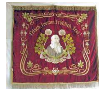
BANNER OF THE GYMNASIAC SOCIETY OF MALINNIK 1912 silk, satin weave, embroidery

The further part of the exhibition shows the main issues concerning history of the town from the second half of the nineteenth century until 1945: urban development, railway and municipal transport system, tourism, services, associations, sports and culture. Besides the keepsakes illustrating these issues